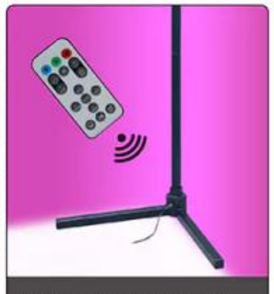
Step 6: Use Remote control or Tuya APP set up your conner light.

The Acrylic lampshade with temperature resistance. Perfect light transmittance for real light color, The metallic paint makes lamp body smooth and shiny. The product edges all pass fine grinding, the surface is glossy and smooth. There are 3 sponge mats at the bottom of the lamp which can effectively avoid scratches.