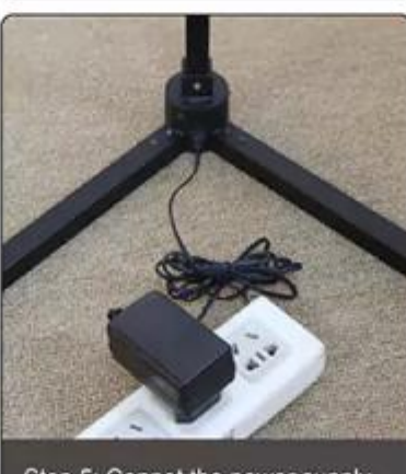
Step 5: Connet the power supply.